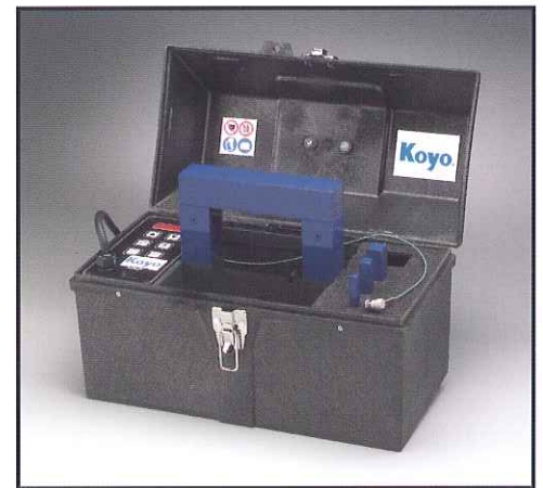
Portable Heater BH210P