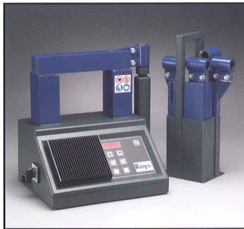
Stationary Heater BH340S