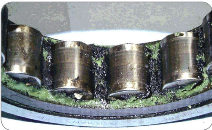
Lubricant degradation caused by electrical discharge currents