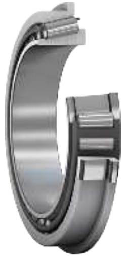
Flanged tapered roller bearings with outer ring coating

In addition to the standard range SKF can offer special coated ring designs, large size bearings and bearing units.