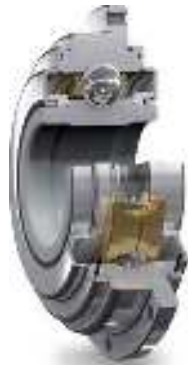
Traction motor bearing units with inner ring coating