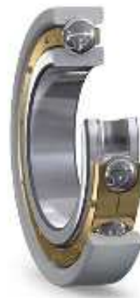
INSOCOAT deep groove ball bearings with outer ring coating