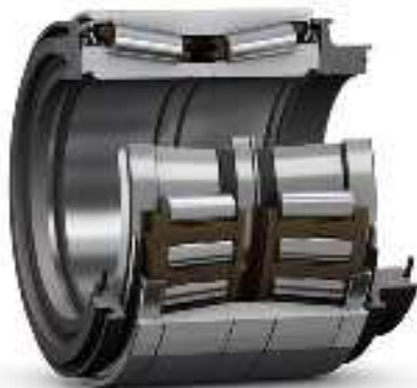
Tapered roller bearing units with outer ring coating