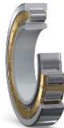
INSOCOAT cylindrical roller bearings with inner ring coating