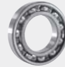
Steel ball guided cage