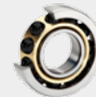
Bronze ball guided cage